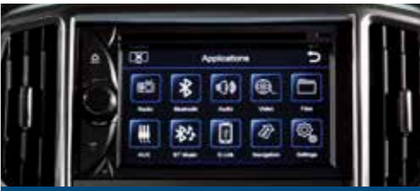
Touchscreen Audio System, Bluetooth Connectivity, GPS Navigation, Reverse Camera & Smart E-Link