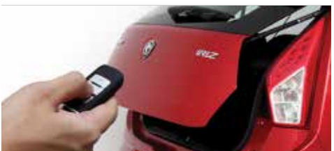
Remote Trunk Release