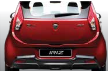
LED Rear Combi Lamp & Rear Diffuser**