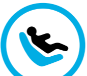
ISOFIX & Top Tether