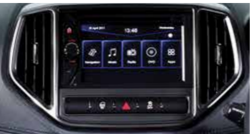
Touchscreen Audio System, Bluetooth Connectivity, GPS Navigation, Reverse Camera & Smart E-Link*