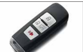
Passive Keyless Entry