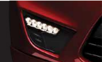
LED Daytime Running Lights