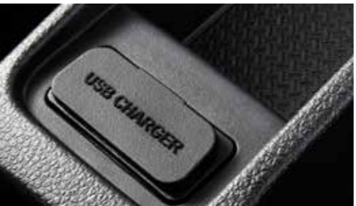
Rear USB Charger**