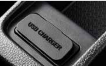
Rear USB Charger