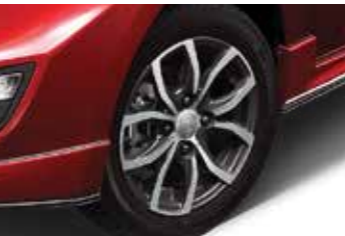
15" Alloy Wheels*