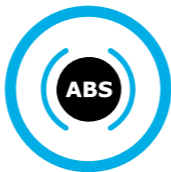
Anti-lock Braking System (ABS) + EBD