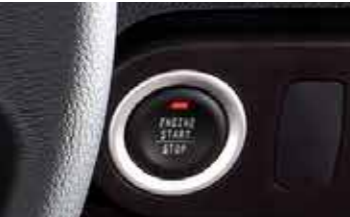
Push Start Button