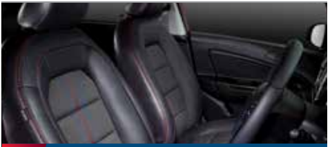
Sporty Seats with Graphic Print*