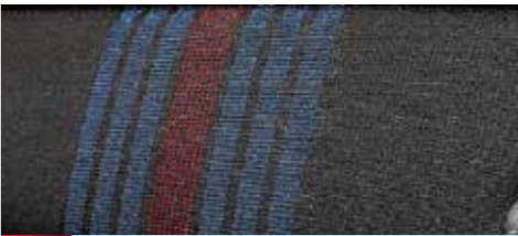
Fabric Seat with Graphic Print