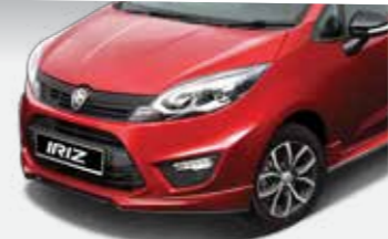
Dual-tone Body Kit