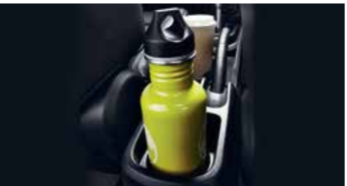
7 Cupholders & 10 Compartments