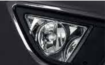
Front Fog Lamp