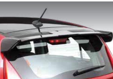
Sporty Rear Spoiler*