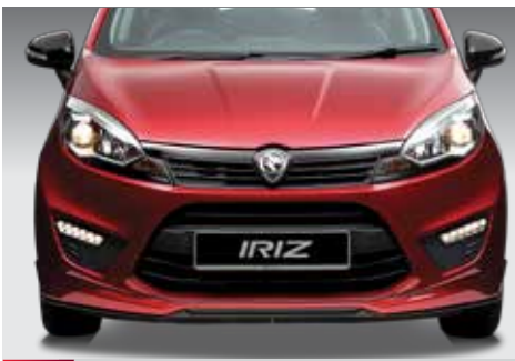
Glossy Black Front Grille