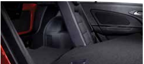
Rear Seat 60:40 Folding