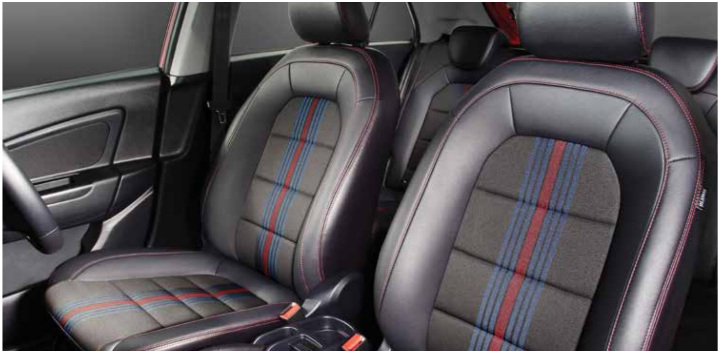
Sporty Seats with Graphic Print*