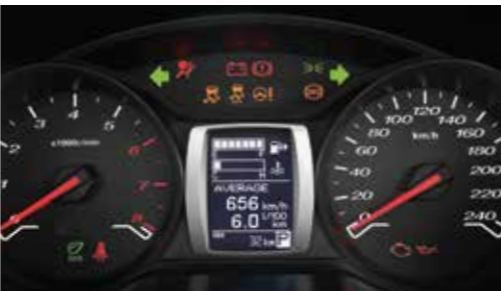
Multi Info Display