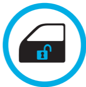
Impact Sensing Door Unlock