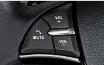
Steering Audio Switches