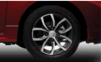
15" Alloy Wheels