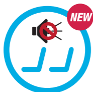
Improved Cabin Comfort