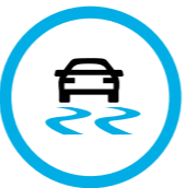
Electronic Stability Control (ESC) with Traction Control