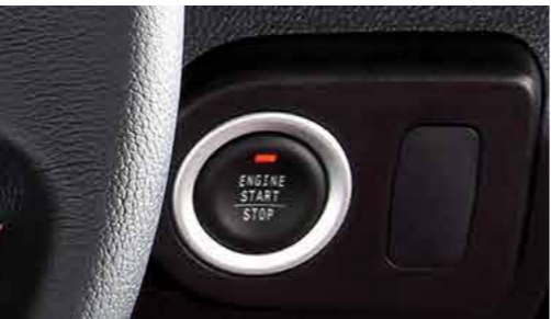
Passive Keyless Entry with Push Start Button**