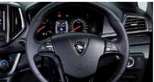
Electric Power Steering