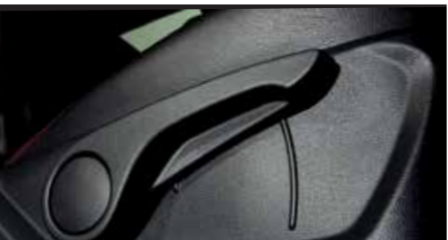
Driver Seat Height Adjuster