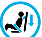
Dual Pre-tensioner Seatbelt