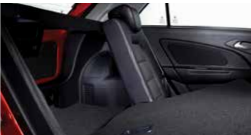
Rear Seat 60:40 Folding