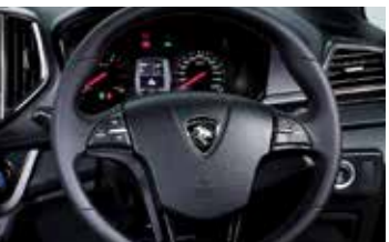
Electric Power Steering