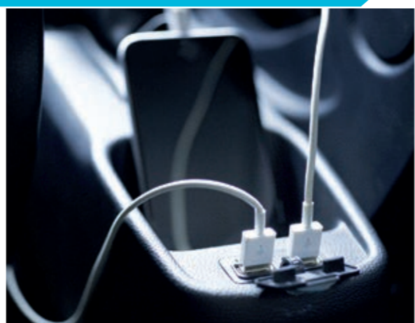
2 Rear USB Chargers