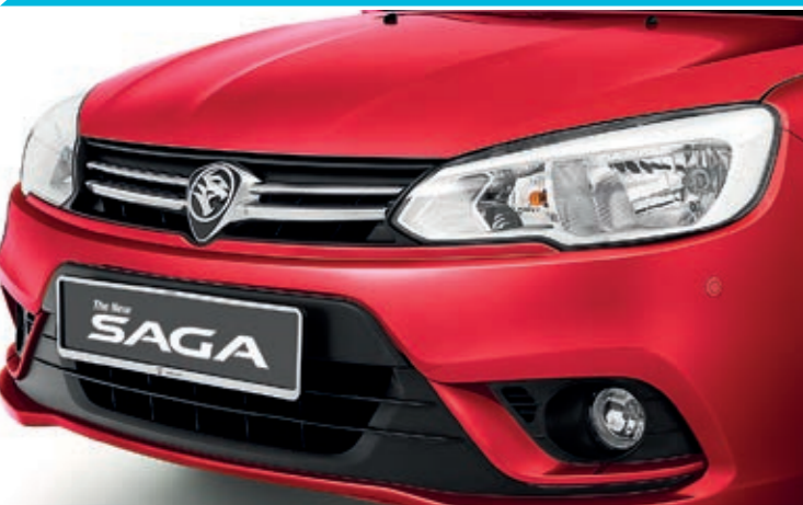
Modern Presence Front Face