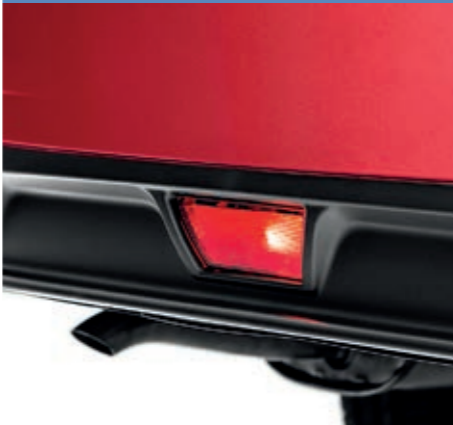
Rear Fog Lamp