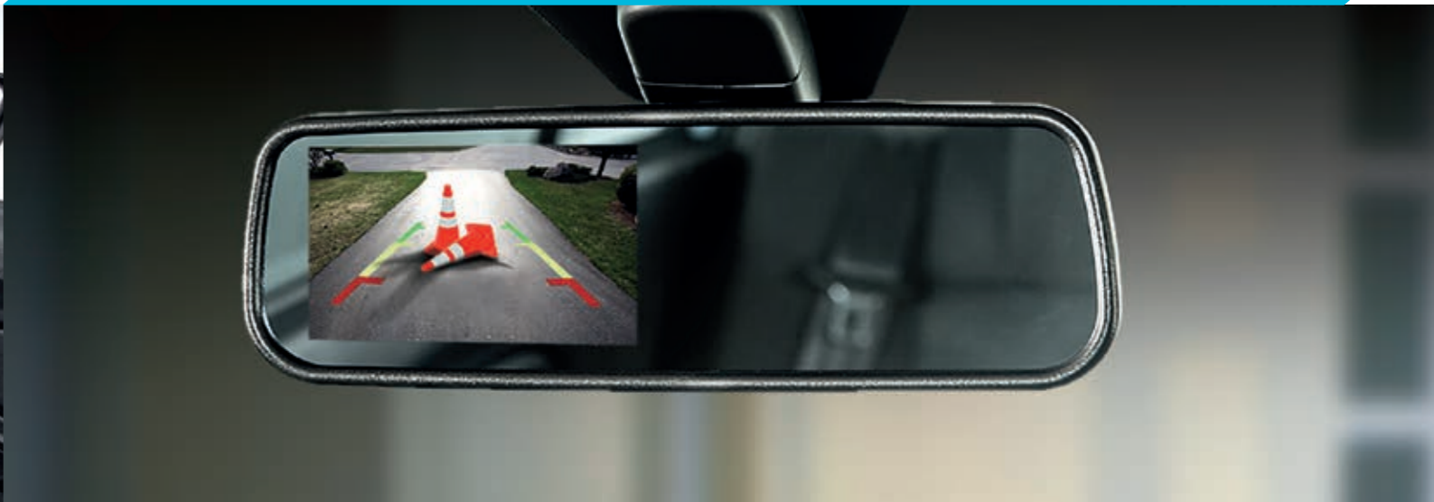
Reverse Camera with Rear View Mirror Display*