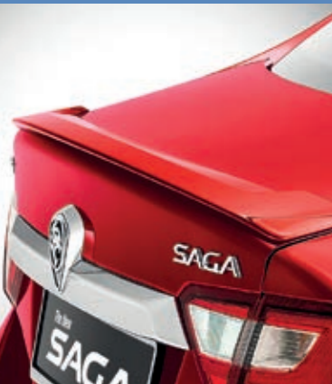
Edgy Rear Spoiler**