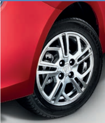
Stylish 15" Alloy Wheels*