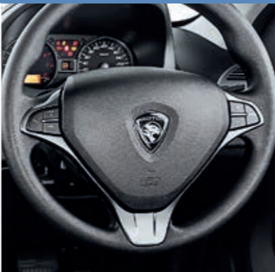
Steering Audio Switches*