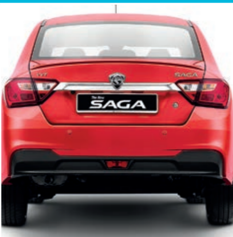
2 Piece Rear Combi Lamp