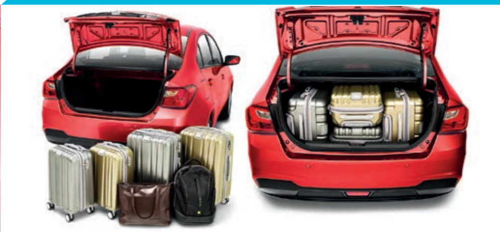
420L Luggage Space