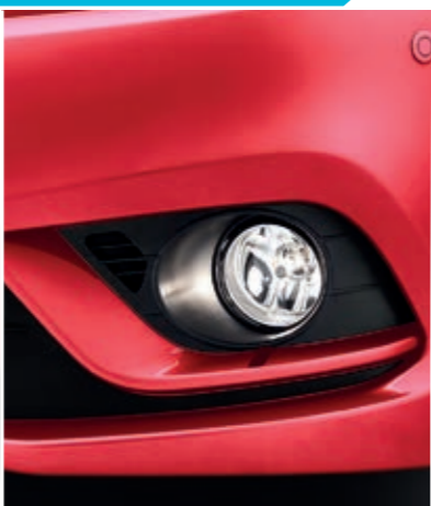
Front Fog Lamp**