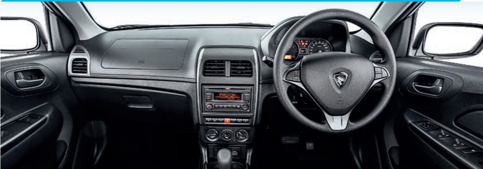
Practical and Ergonomic Instrument Panel