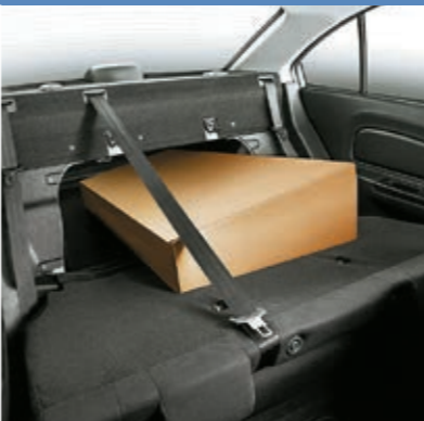
Rear Seat Bench Fold