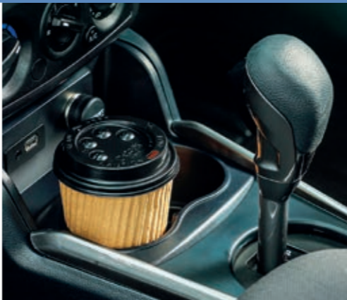
10 Compartments, 2 Cup Holders, 4 Bottle Holders