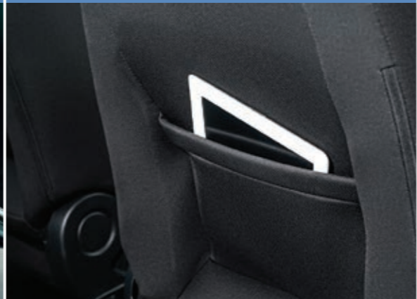
2 Front Seat Back Pockets**

Standard, Executive and Premium. Whichever you choose, the new Saga provides distinctive options that add variety, without compromising on safety and comfort.