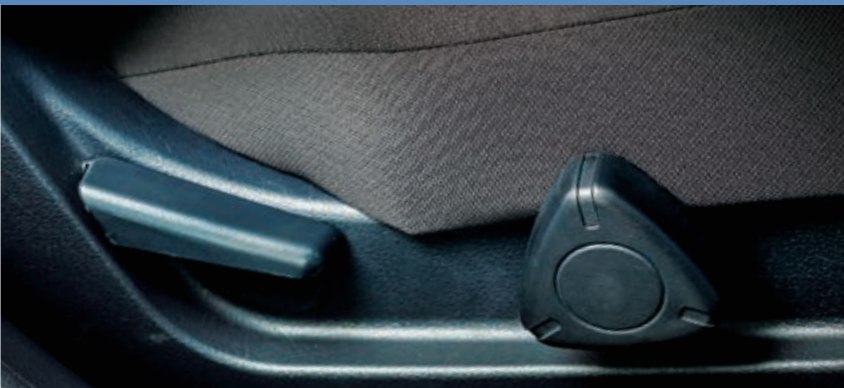
Driver Seat Height Adjuster